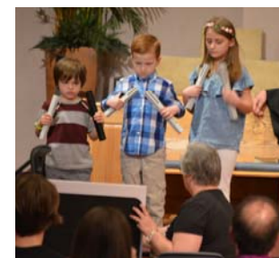
Handbell Festival and Sunday at Church